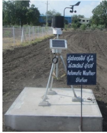
Automatic Weather stations