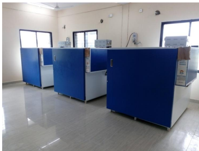
Environmental /Plant Growth Chambers with CO 2 , Temperature, Relative Humidity and Light regulation