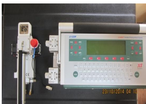
Photosynthesis system (Infrared Gas Analyser)