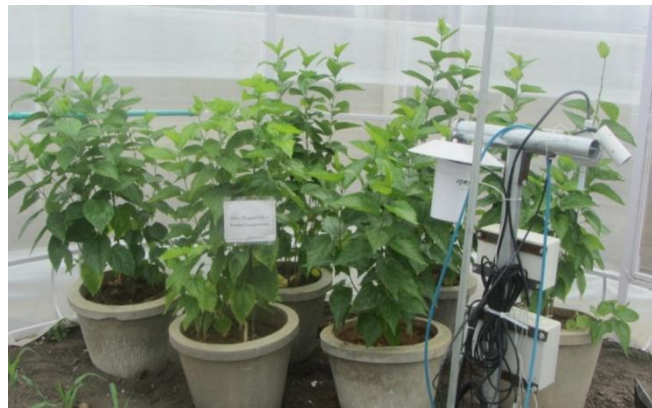
Mulberry grown in open top chambers