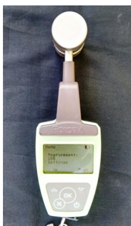
Dualox Scientific sensor used for Leaf chlorophyll, flavonoids, Nitrogen balance index and anthocyanin measurement