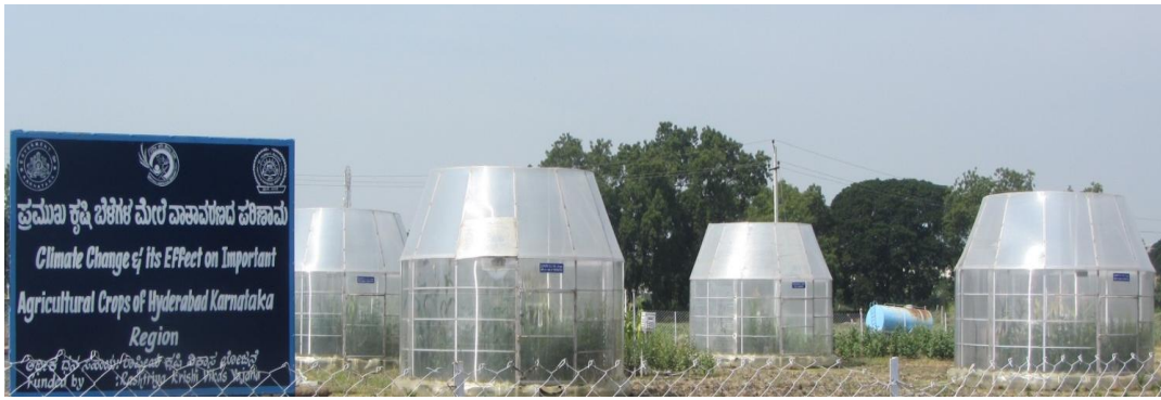
Overview of Open Top Chambers where studies undertaken